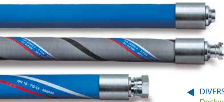
◀ DIVERSE CONNECTION OPTIONS: Dockweiler hoses with TriClamp, Aseptic connections, welding ends and ZeroCon

Dockweiler hoses made from high quality elastomer and thermoplastic produce flexible connections for system components. They have all necessary approvals (like FDA, USP, Class VI) and comply with the pharmaceutical requirements. For us, every hose is one of a kind: Lengths, connections and materials can be mixed and matched and are tailor made. TriClamp, aseptic connections, welding ends and ZeroCon are available as connectors. Dockweiler hoses are used in the chemical and pharmaceutical industries as well as the food sector and biotechnology sector. They are used wherever quick and flexible connections are required.