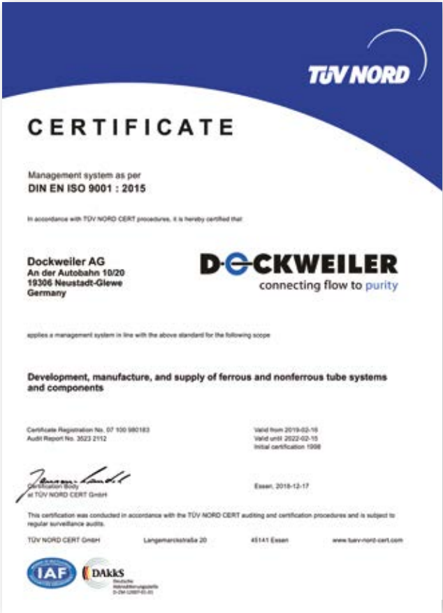
DIN EN ISO 9001