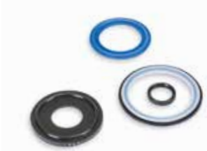
DOCKWEILER LASERMARKED GASKETS For total traceability