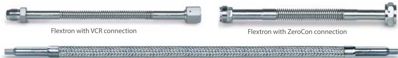
Flextron with VCR connection

Flextron is manufactured from mechanically corrugated stainless steel (1.4404), as standard. A stainless steel wire braid can also be used to achieve a higher pressure resistance. The unique combination of electropolished surface and flexible corrugated hose minimizes the risk of contamination and enables gas transport under full UHP conditions throughout the system. With Flextron, oscillations and vibrations can be decoupled and done to the highest purity standards.