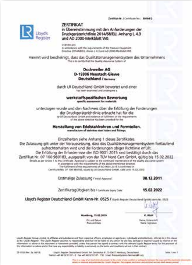
PED 2014/68/EU and AD 2000 WO