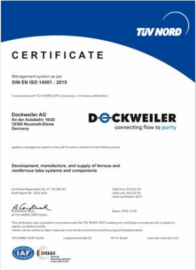
DIN EN ISO 14001