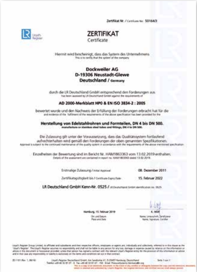
AD 2000 HPO