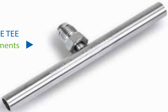
PURGE TEE for connecting measuring and control elements

In addition to threaded, flanged or clamp connections, the Dockweiler connection components can also be equipped with the patented ZeroCon connection. With our many years of manufacturing expertise, we ensure low dead space design and flow-optimized profile.