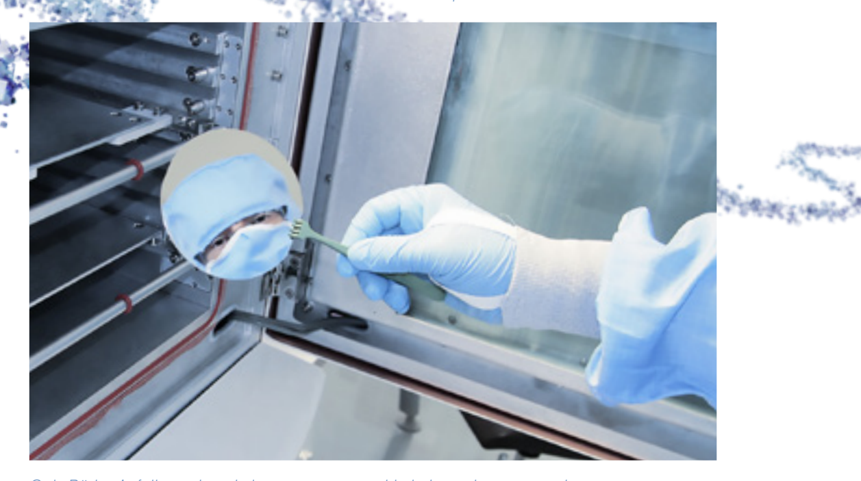
Only Bürkert's fully-equipped clean room can enable independent preparation of the required components.